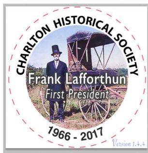
2017 Founder's Day Button